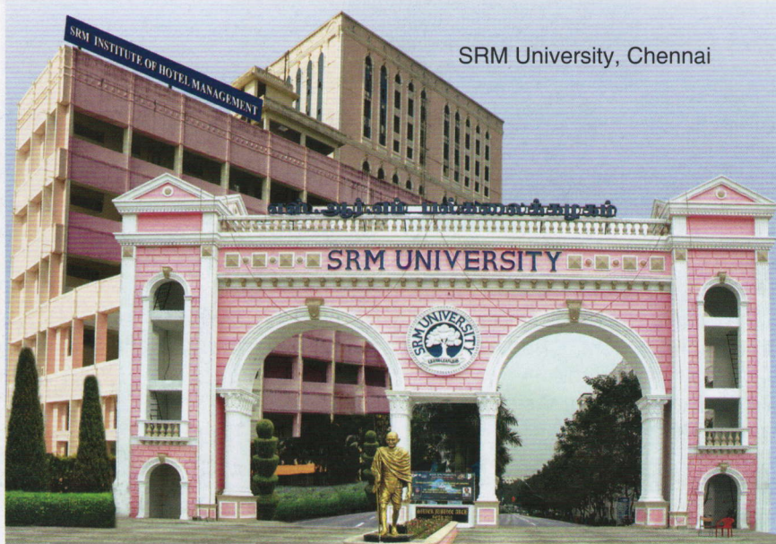
SRM University, Chennai